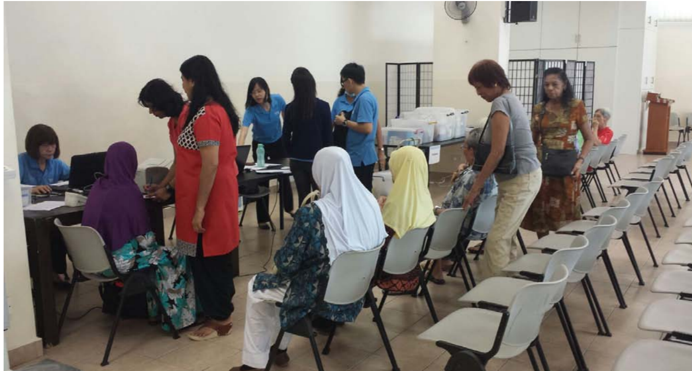
Participants waiting to get registered for Doctors-On-Wheels services at Mar Thoma Syrian Church.

On 17 September 2016, SATA CommHealth Doctors-On-Wheels (DOW) set up at a new site in partnership with Mar Thoma Syrian Church in Singapore. This mobile clinic, located at Jalan Keli on the grounds of the church, runs every eight weeks on Saturdays and will provide healthcare services to the beneficiaries. To date, we have held two further DOW sessions on 12 November 2016 and 14 January 2017, where we have witnessed a notable growth in patient numbers.