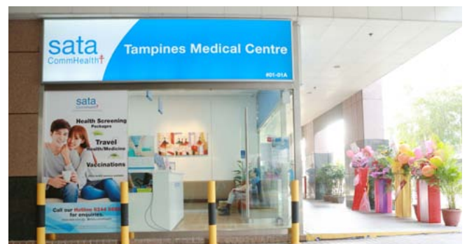
View of SATA CommHealth Tampines Medical Centre from Telepark Building carpark exit.

checks (such as pre-employment, work permit, social visit pass, student pass) and wound management. Besides these, some specialised tests are available at the medical centre with a general practitioner's referral. Cont'd page 2