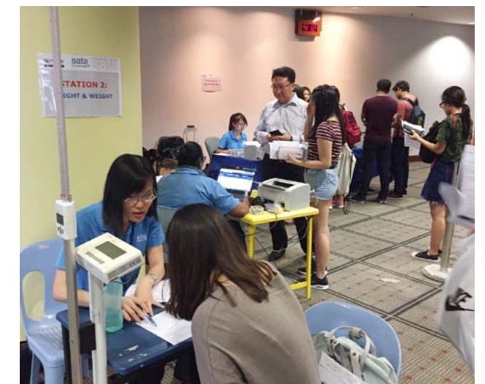
Students registering for their pre-admission medical check ups at Nanyang Polytechnic.

This year, SATA CommHealth health screening buses were stationed at Republic Polytechnic in Woodlands and Nanyang Polytechnic in Ang Mo Kio to add convenience to the health screening service for new polytechnic students.