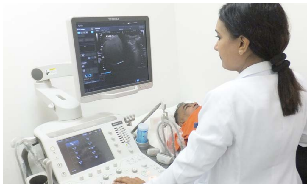
Ultrasound pelvis screening, one of the diagnostic imaging services at SATA CommHealth Tampines Medical Centre, in progress.

Being held concurrently with the opening ceremony was the nineteenth Community Health Day for the public. A multitude of free health checks on body mass index, blood pressure, blood glucose, osteoporosis and pre-physiotherapy assessment was offered. Over 180 participants who resided in this area benefitted from this event. In line with its mission of promoting lifelong health and serving the community, SATA CommHealth is dedicated to providing accessible health screening for the community over the last seven decades. □