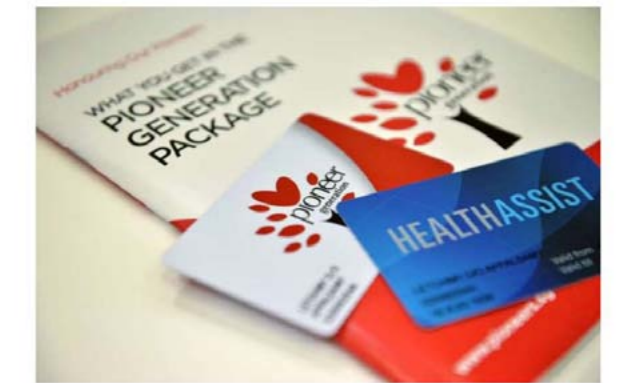
The Pioneer Generation cards with an information booklet on the Pioneer Generation Package.