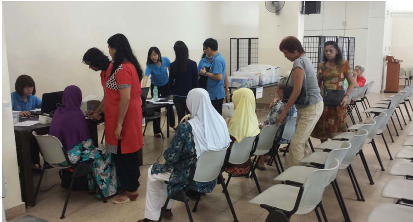
Participants waiting to get registered for Doctors-On-Wheels services at Mar Thoma Syrian Church.

On 17 September 2016, SATA CommHealth Doctors-On-Wheels (DOW) set up at a new site in partnership with Mar Thoma Syrian Church in Singapore. This mobile clinic, located at Jalan Keli on the grounds of the church, runs every eight weeks on Saturdays and will provide healthcare services to the beneficiaries. To date, we have held two further DOW sessions on 12 November 2016 and 14 January 2017, where we have witnessed a notable growth in patient numbers.