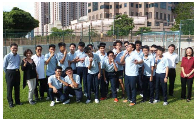
Group photo of the Boys' Brigade members who attended the training and SATA CommHealth staff and trainer.

On 8th December 2016, SATA CommHealth had the privilege of conducting the established Boys' Brigade (BB) Smoke-free Ambassador training course at a location very familiar to the Brigade's boys. The course was held at the Boys' Brigade headquarters and received an enthusiastic response from BB youth members. They were mainly students from Raffles Institution, Fairfield Methodist Secondary, Nan Hua High School and Orchid Park Secondary School fascinated on the ways to stub